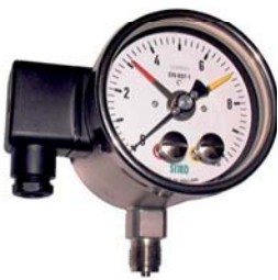
Contact pressure gauges