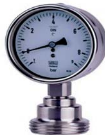
Hygienic pressure gauges