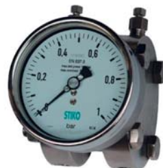
Differential pressure gauges