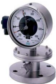
Diaphragm pressure gauges